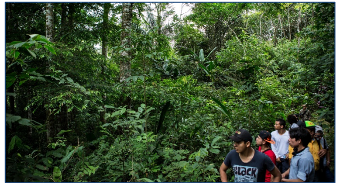
Sinfonía Trópico is one of the climate education initiatives we recommend and support

We are happy to add climate charities to this list in coordination with clients and partners.